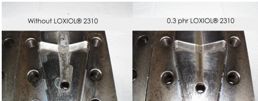
Figure 3: Comparison of plate-out performance without (left image) and with 0.3 phr LOXIOI ® 2310 (right image) after 60 minutes extrusion.

with LOXIOI ® 2307, best results for an optimal rheological behavior and minimal plate out can be achieved.